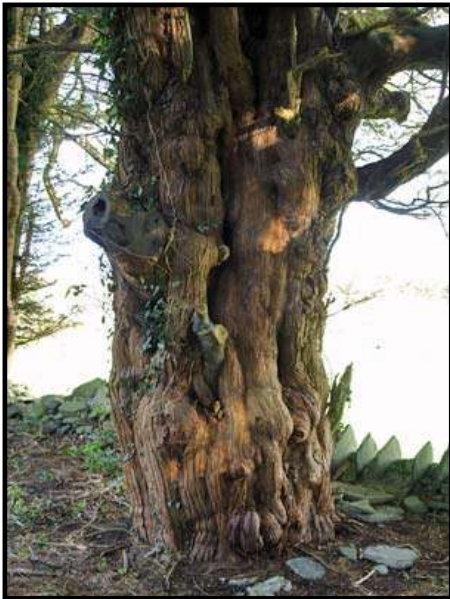
Broughton-in-Furness tree 3